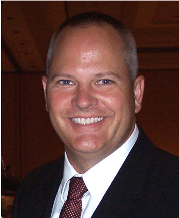
Story City, IA

“In addition to the management education, I have gained invaluable peer insight and have developed many industry friends through my participation in the PFMM program.”